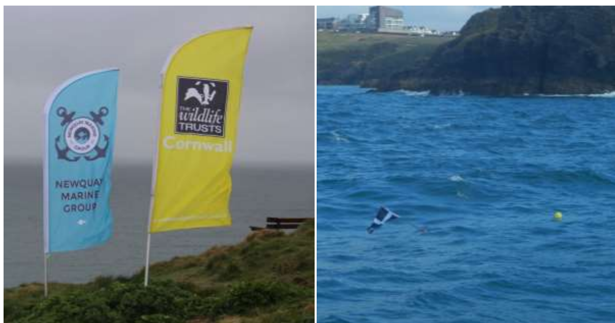
Photo 3: A seawatch has to be undertaken during the day and poor weather conditions can impact sightings (left). The C-POD-F marker buoys (right), the instrument can record cetacean activity 24/7.

Our project trialled the newest POD design, the C-POD-F which has been designed with this in mind. This POD records over greater range of frequencies than previous POD designs, and is therefore able to record several species in one deployment. Previous versions of the POD required the frequency range to be set to the target species. One of the aims of this project was to assess the potential for creating 'acoustic identifiers' for different dolphin species based on the recordings from the C-POD-F. The ability to reliably identify species through acoustic data alone would be beneficial to the field of cetacean research, minimising the man hours required to carry out land or boat surveys as these species are not easily surveyed by eye as they spend much of their time underwater. Acoustic data can also provide more information on the vocalisations produced during different behaviours such as echolocating, feeding, socialising or sleeping, providing an insight into not only the abundance and distribution of a species but also into their behaviours at different times of the day or year and in different locations.