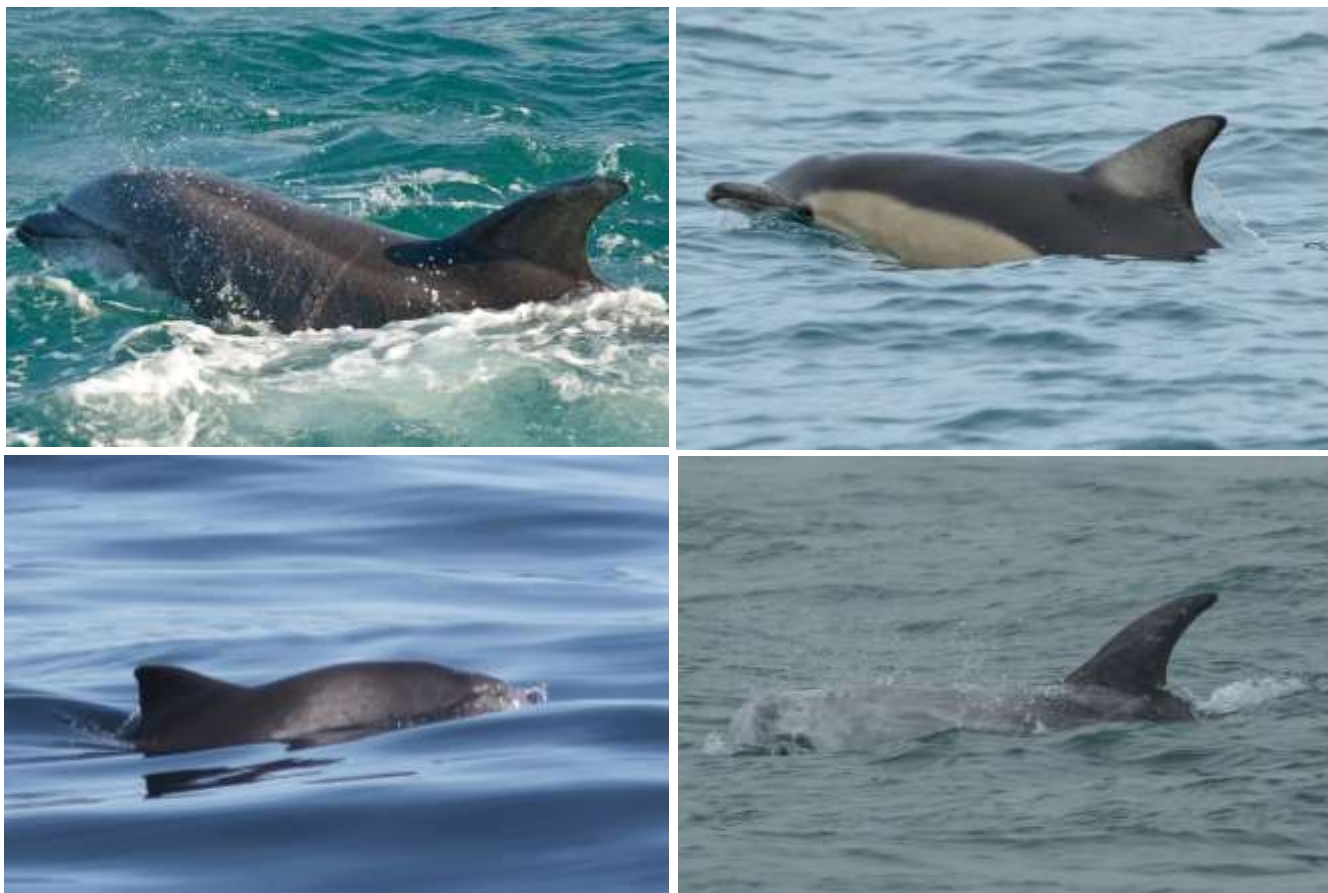
Photo 6: The four species sighted throughout this project. Bottlenose dolphin (top left), common dolphin (top right), harbour porpoise (bottom left) and Risso's Dolphin (bottom right).