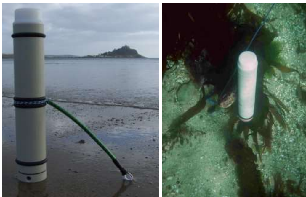
Photo 2: A POD up close (left) and a POD deployed underwater (right).

The C-POD-F used in this monitoring project can record over a larger range of frequencies than previous versions with a frequency range of 17-220kHz, encompassing the sounds produced by both common and bottlenose dolphins and harbour porpoise. This POD design has a recording range of about 4km in all directions.