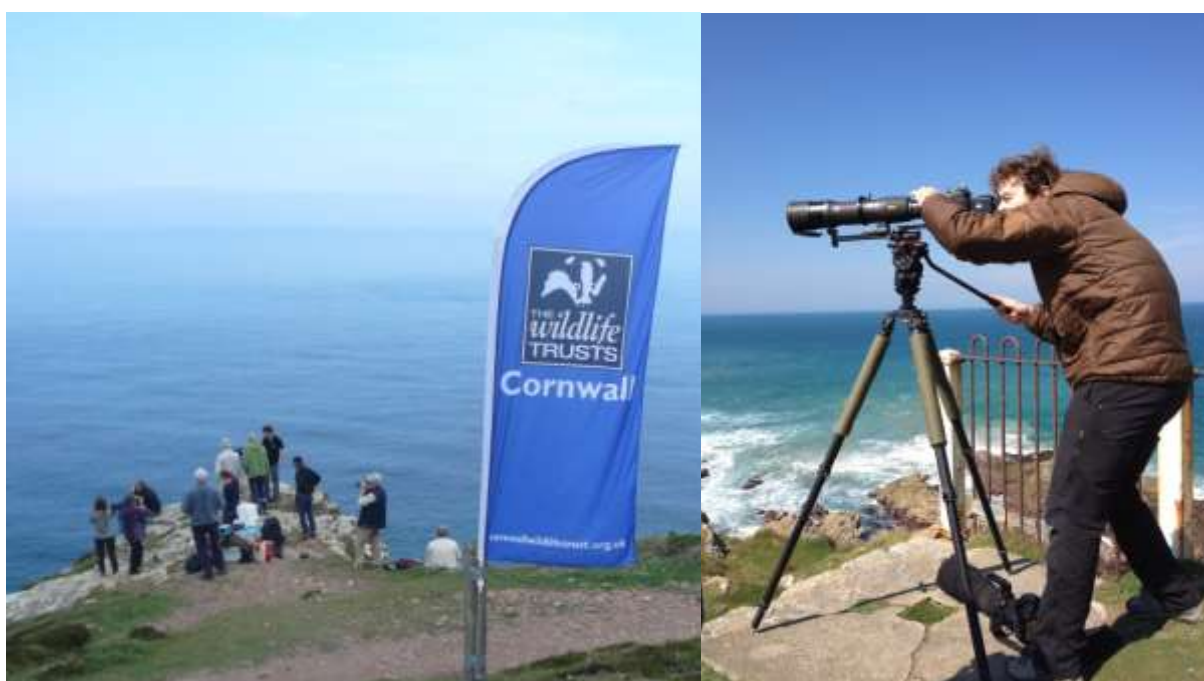
Photo 4: A public Seaquest survey event (left); A volunteer surveying at Towan Head (right).

To collect the sightings records for the acoustic monitoring project, the Seaquest Southwest recording methods and forms were utilised by trained volunteers to record marine mammals, particularly cetacean, sightings at the POD location. However additional information was required from surveys, including details of birds that were seen diving or feeding nearby. This can allow prediction of the prey species (fish) that may be present, influencing the feeding behaviours and vocalisations likely to be displayed by dolphins. Additionally, an outline map of the watch point and POD location was provided where details of direction of travel of cetaceans could be recorded (heading towards/away from/alongside the POD). This aided analysis of acoustic records. During these surveys, it was also important to record 'zeros' in line with Seaquest recording methodology as the POD may record activity from animals that were not seen from land.