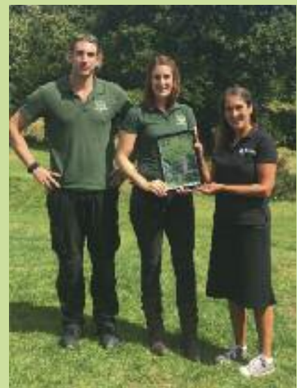
CORNWALL WILDLIFE TRUST