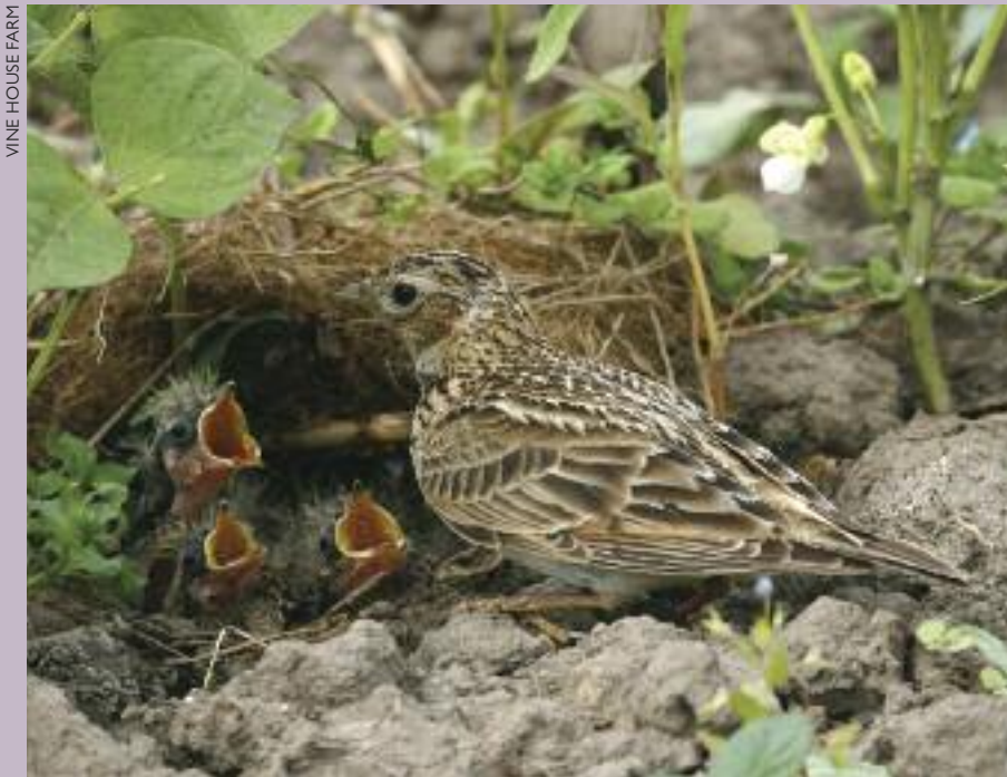
VINE HOUSE FARM

By growing seed specifically for bird food and packing this seed on its own farm, their overheads are kept to a minimum which helps maintain low prices and uses a relatively low carbon footprint. Nicholas Watts, Owner, "The way we operate also means we have unrivalled control over product quality – for example, in the case of seed such as our own black sunflower, red millet and white millet, we monitor the journey from the moment it's sown in the ground to the moment it's delivered to your door".