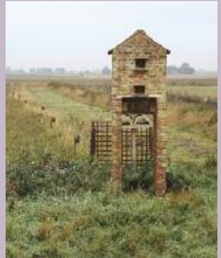
VINE HOUSE FARM

Long-standing Trust Wildlife Partner Vine House Farm is a traditional arable farm passed down from one generation to the next, and situated in the Lincolnshire Fenlands. The land is farmed in a way that is sympathetic to the wildlife that shares our environment; we encourage many species by offering the wide range of habitats needed. As a result of endless time and commitment, we are observing increases in bird populations compared to national populations which are either static, or declining.