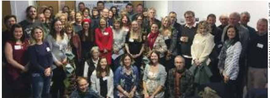
CORNWALL WILDLIFE TRUST

Cornwall Wildlife Trust's recent 'Wild Business' networking breakfast was hailed a success by those that attended and 100% of respondents agreed that: 'Incorporating nature into business can benefit people and the environment'. The event, held in partnership with the University of Exeter Business School, included a series of talks and workshops focusing on corporate social responsibility, nature and sustainability. Delegates also heard case studies from local business, such as the award-winning accommodation provider Railholiday and the renowned organic children's clothing company Frugi who shared their sustainable working practices.