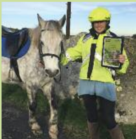
CORNWALL WILDLIFE TRUST