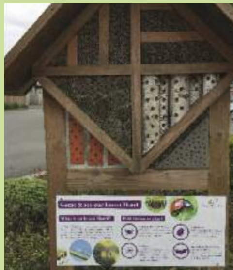
CORNWALL WILDLIFE TRUST