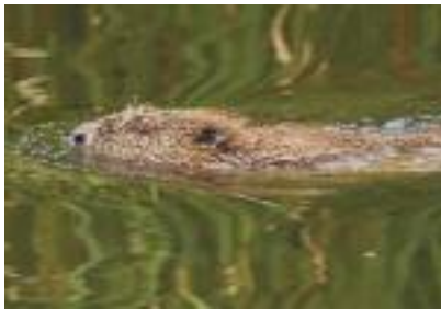
BEAVER

Bring Beavers Back! The Trust and Business Member Woodland Valley Farm are bringing beavers back to Cornwall for the first time in 400 years! We are raising money to start the Cornwall Beaver Project which will settle two beavers at the farm near Truro.