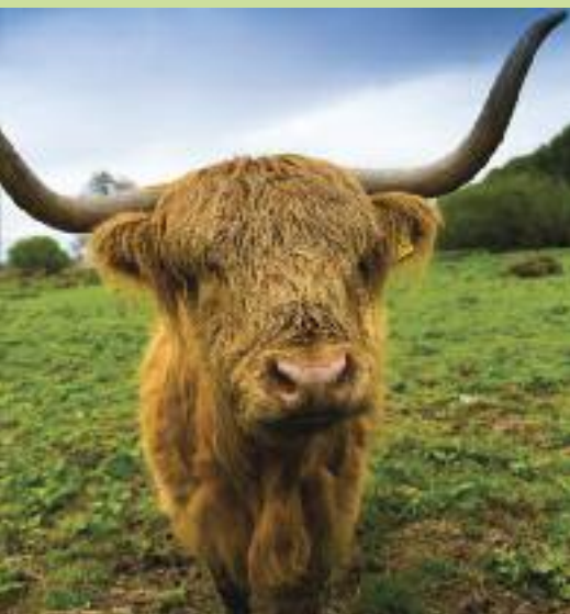
LOWER MARSH FARM

89% of children are happy being outdoors according to a poll by The Wildlife Trusts . The same survey also revealed that the vast majority like seeing wildlife in their garden or local area, and that they enjoy playing outside doing activities such as climbing trees and building dens. If you have your own business and would like to hold a bespoke Wildlife Education Session for children on your site, please contact us to discover more.