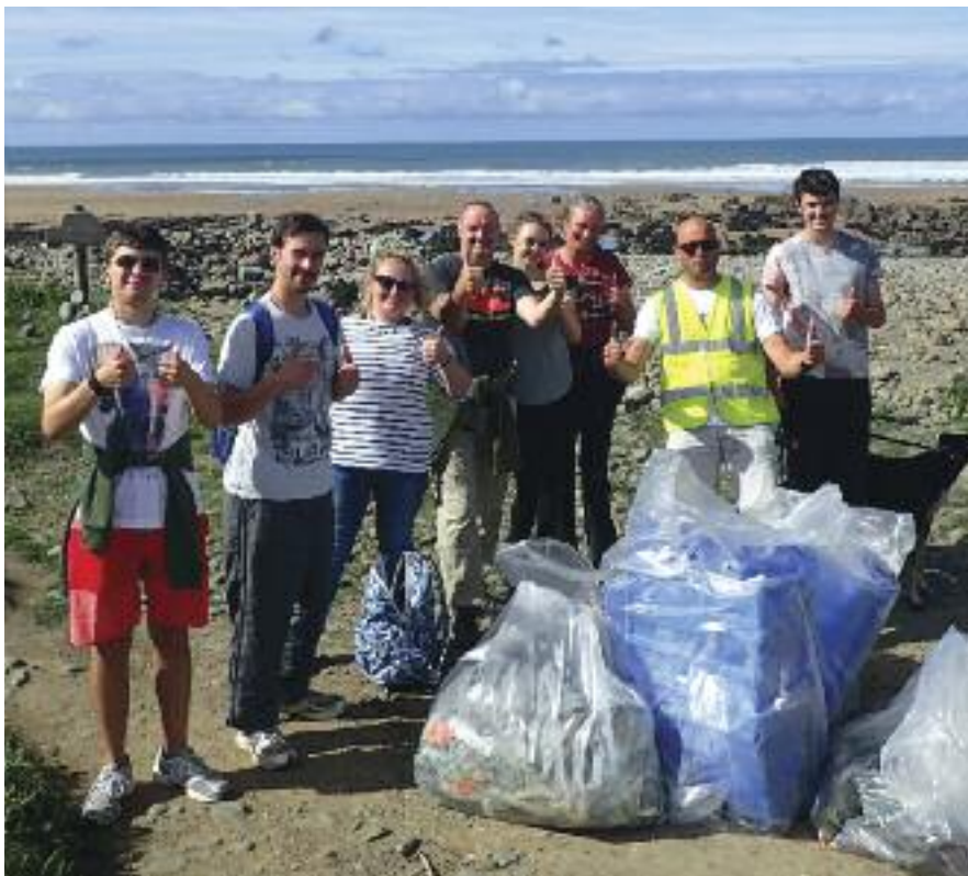
CORNWALL WILDLIFE TRUST